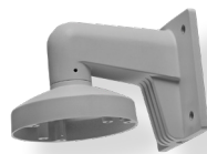
Wall Mount Camera Mount ST-WM1