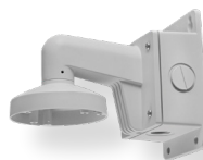
Wall Mount Camera Mount ST-WM1B