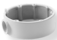
Junction Box Camera Mount ST-JB1