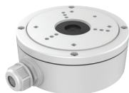
Junction Box Camera Mount ST-JB1