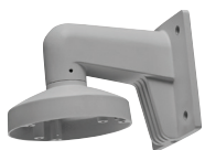
Wall Mount ST-WM2