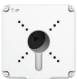
Junction Box ST-GJB07-C