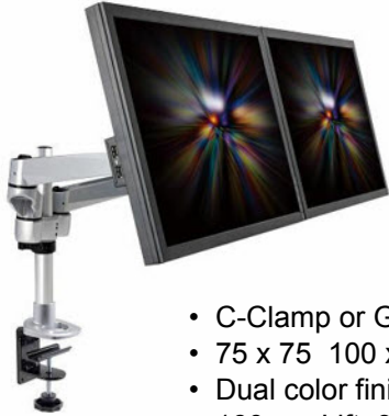
CT-LCD-2MDSW Two Monitor Dual Swivel Arm Mount