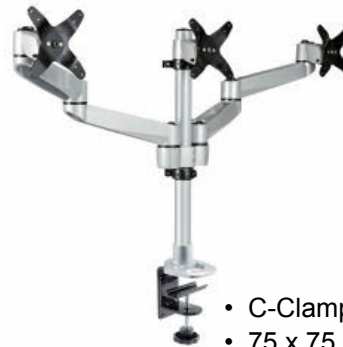
CT-LCD-3MDSW Three Monitor Dual Swivel Arm Monitor Mount