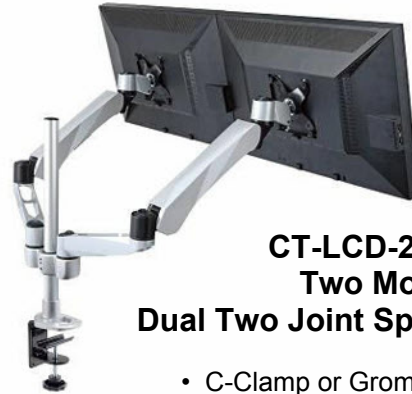
CT-LCD-2M2JSP Two Monitor Dual Two Joint Spring Arm Mount