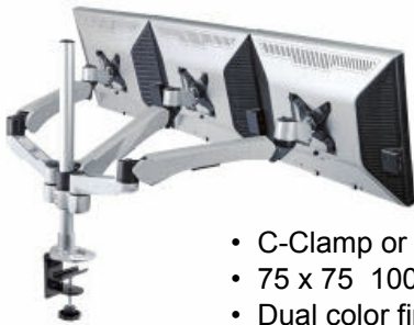
CT-LCD-3M2JSP Three Monitor Dual Spring Arm Monitor Mount