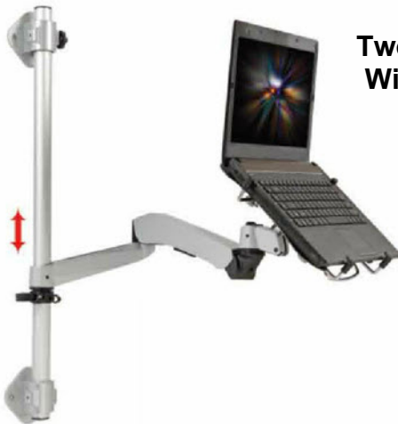
CT-PCMOUNT-2JSP-WALL Two Jointed Spring Arm Laptop Wall Mount With Integrated USB Powered Cooling Fan