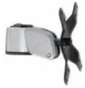
Table Thickness: 20-110mm (C-Clamp) Table Hole: 10-60mm (Grommet)