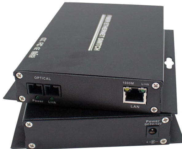
Model Number: FT-EMCU-1G-SM-DX-WM-KIT 10/100/1000Mbps Ethernet Media Converter

Fiber Optic 10/100/1000Mbps Ethernet Transmission System