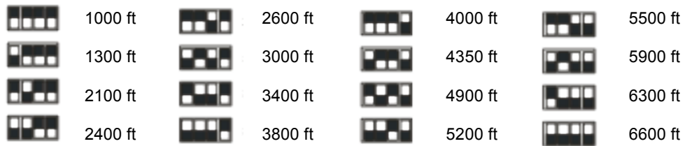
Active receiver sharpness chart (suggested for best color video transmit distance)