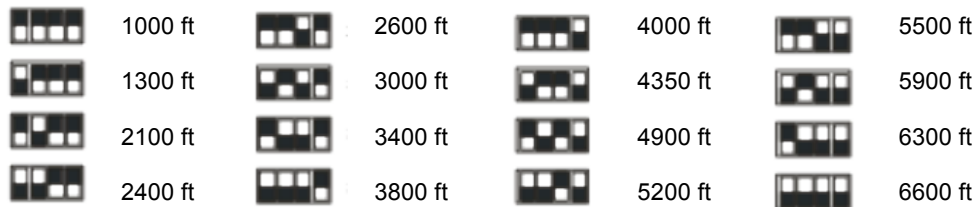
Active receiver sharpness chart (suggested for best color video transmit distance)